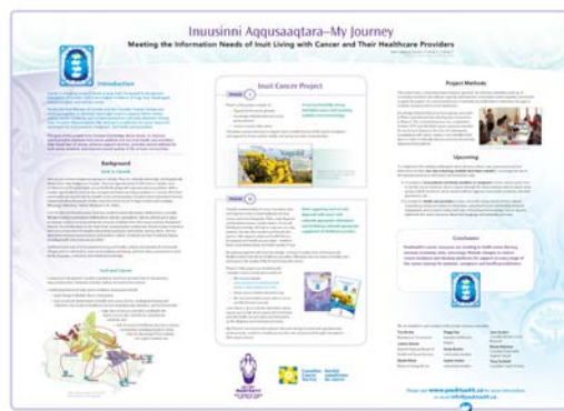
Left: the poster we presented at the Public Health 2019 conference in Ottawa Right: the Ikajurniq poster displayed at the Canadian Association for HIV Research You can find more information about these projects on our website at pauktuutit.ca/health