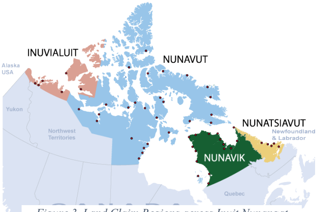
Figure 3. Land Claim Regions across Inuit Nunangat

Inuit are marginalized in discussions of indigenous issues in Ontario, yet have the highest acuity of need.