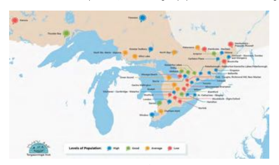
Figure 4. Distribution of Inuit across Ontario

An increasing amount of Inuit live outside traditional homelands; the population in Ontario is estimated at 10,000. Population growth rates in Ontario continue to rise because of migration and high fertility rates and are distributed across the province, with the largest population in Ottawa. See Figure 4.