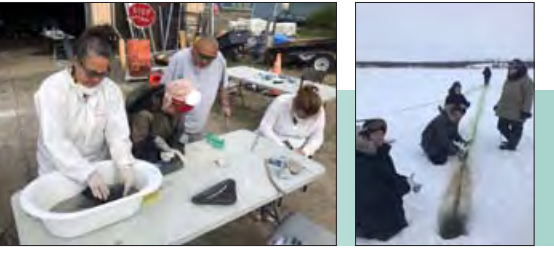
Nunavik Qajaq Network Facebook page https://www.facebook.com/search/ top?q=nunavik%20Qajaq%20Network

"Trigger" is a term for a reminder that leads people to relive a traumatic experience. It can include a person, words, places, sounds or smells. It is a subconscious reaction (that the individual is not fully aware of) that can cause intense distress and strong emotions.