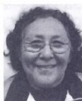
Enooya Enook Baffin Region (North)